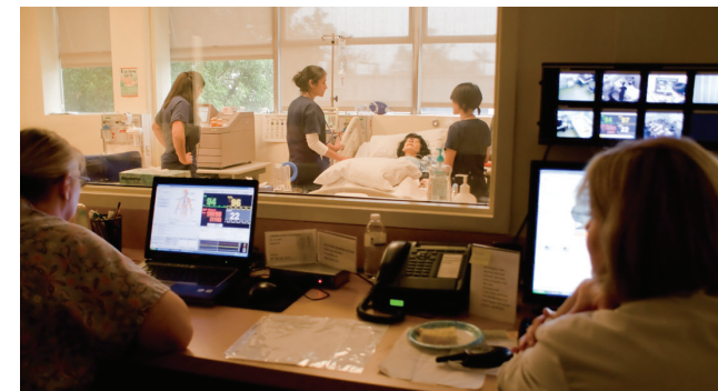
using evidence based practices.

Doctoral students take a mixture of academic courses and clinical rotations. The courses include topics such as anatomy and physiology of the hearing and balance mechanisms, techniques for diagnosing hearing and balance disorders in children and adults, hearing aids and cochlear implants, prevention of hearing loss, testing and treating individuals from culturally diverse backgrounds, and many others. Clinical rotations take place on campus as well as at hospitals and clinics in the community. The four-year program includes a research project that allows students to gain valuable experience in