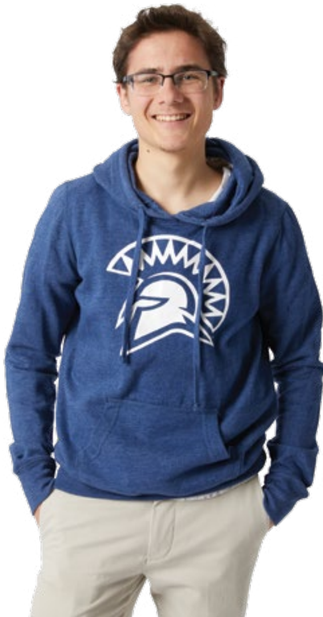
Nikola Biological Science/ Systems Physiology

Pay your enrollment deposit at https://nextsteps.sjsu.edu