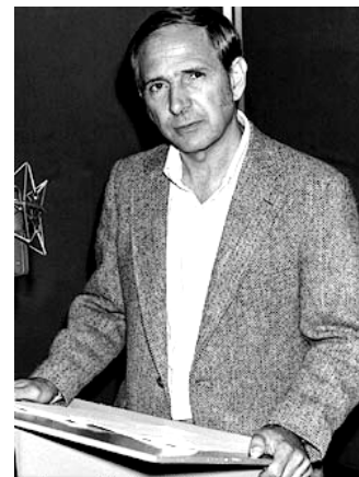
Searle recording the Reith Lectures for BBC in London, summer of 1984, where he first presented the “Chinese Room” argument.