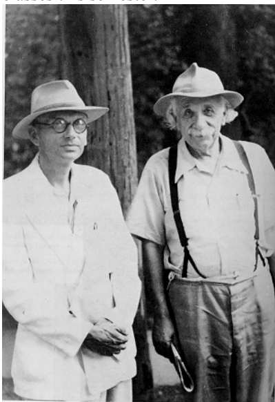
Godel and Einstein, Princeton University, 1950

Other than that, I’m keeping the guitar tuned up, planning to do some hiking, and looking forward to my classes this semester.