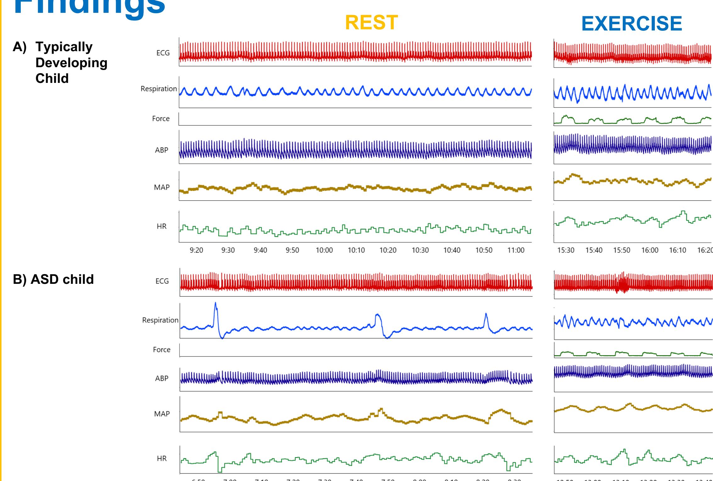
Figure 3. Original records illustrating heart beat (ECG), respiration, arterial blood pressure (ABP), mean arterial pressure (MAP), and heart rate (HR) during 5 minute resting baseline and during 2 minute rhythmic handgrip exercise at 50% MVC in a typically developing child (panel A) and in a child with Autism Spectrum Disorder (panel B).