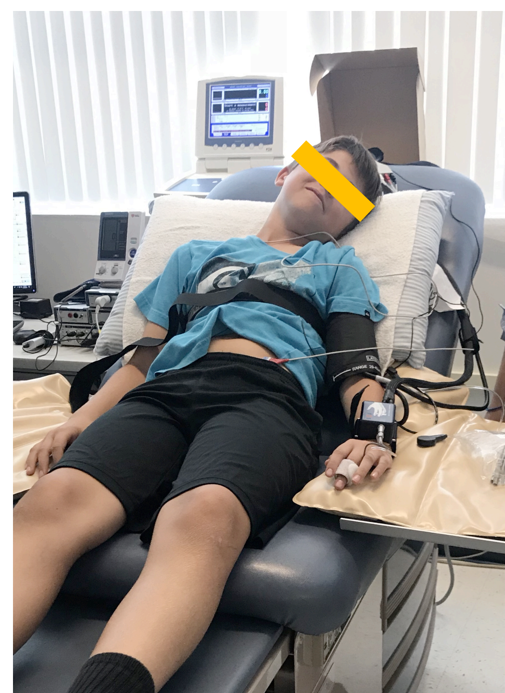
Figure 1. Experimental set-up for overall cardiovascular measurements.